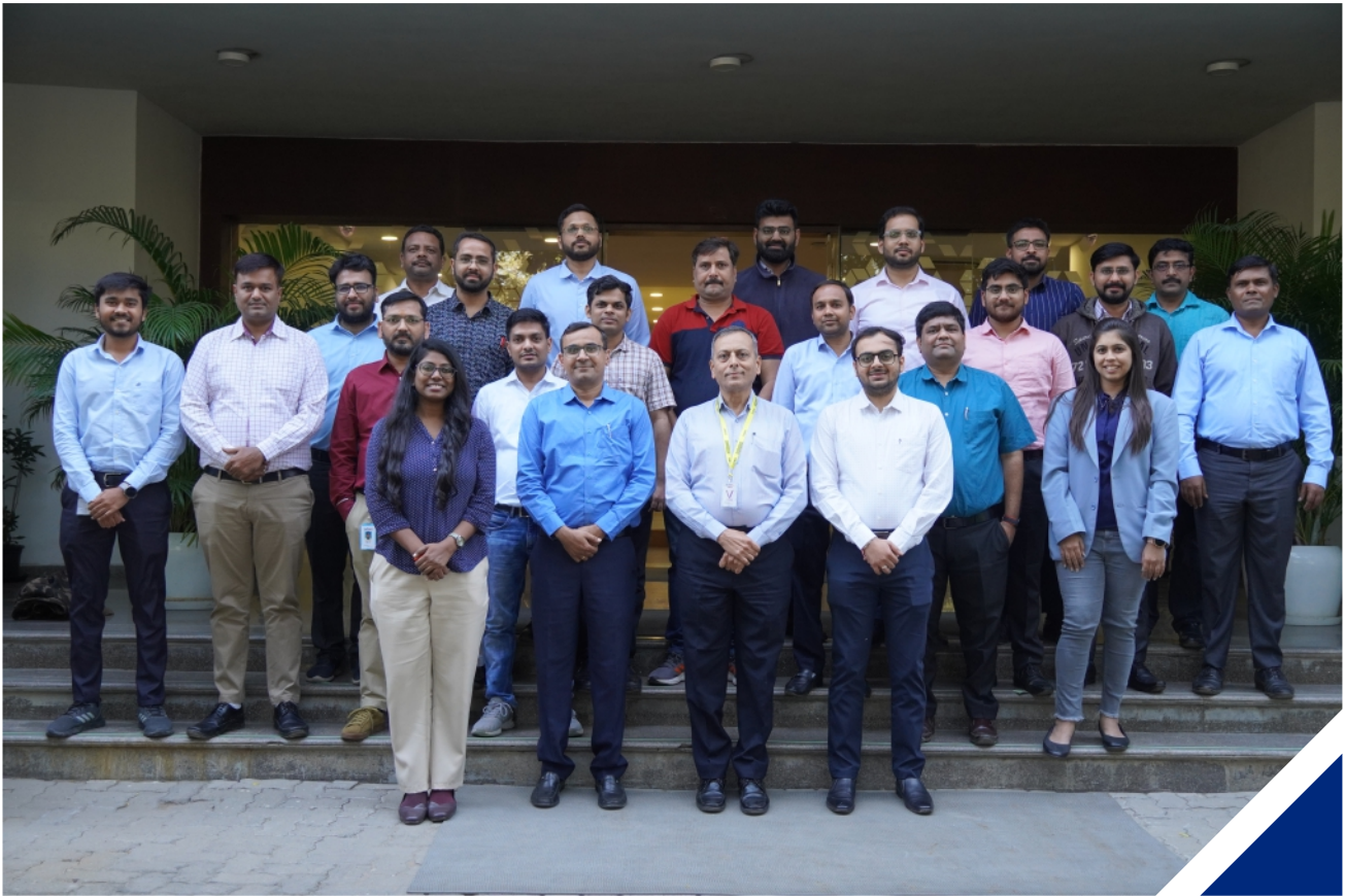
GST Act, Batch - 7